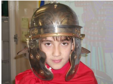
Children in Willow Class learn about The Romans and Robin Hood!