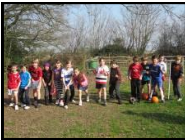
Sport Relief Mile 2012

PSHE involves the development of healthy attitudes of bodily welfare and care, safe living and personal relationships.