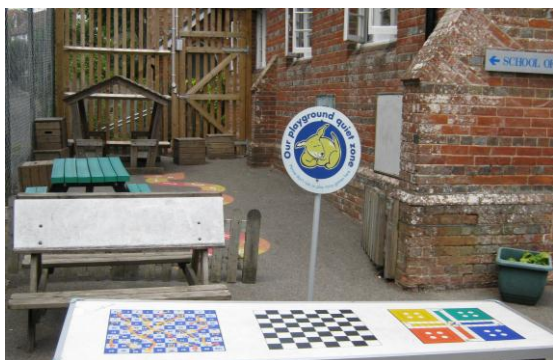
Outside play area

In addition to our three classrooms, our School consists of a recently refurbished hall, in which we serve lunches and where we have a wide range of physical education and music equipment. We also have a library, an ICT suite, cloakroom and administration facilities. Adjoining the school there is a hard surface play area equipped with a wide range of activities for children during their breaks. We use a games field situated about 150 metres away, reached by a bridle path, for outdoor physical education, a vegetable garden and of course, Sports Day! There have been extensions to our school in 1991, 1999, and 2002. We have a large covered area for Early Years structured play, and a pond for environmental work.