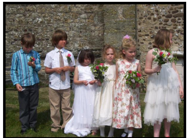
Oak class held their own 'Royal Wedding' in 2011